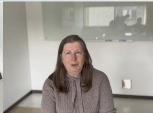
Alla: A Caregiver's Experience Caregiving, stigma, immigrant experience