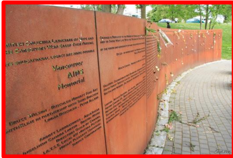
Vancouver AIDS Memorial